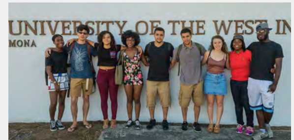
Left and bottom — Tour of the Devon House Heritage Site as part of a study abroad program at the University of West Indies at Mona, spring 2017; right — Statue of Sejong the Great in Seoul, South Korea, fall 2016

of my Colgate experience, leadership donors to the areas of financial aid and summer internship funding have changed the course of my life. As I launch my career in digital media, I know that the best thank you I can give to the Presidents' Club is to achieve the greatest success possible and continue to contribute to this great University.